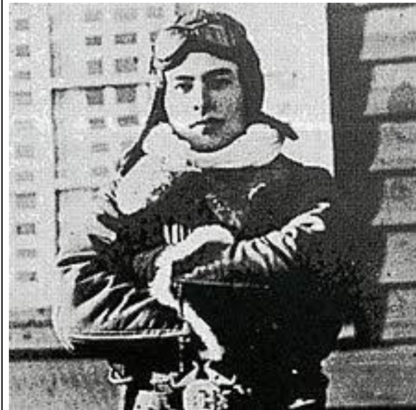
A student kamikaze pilot on eve of flight