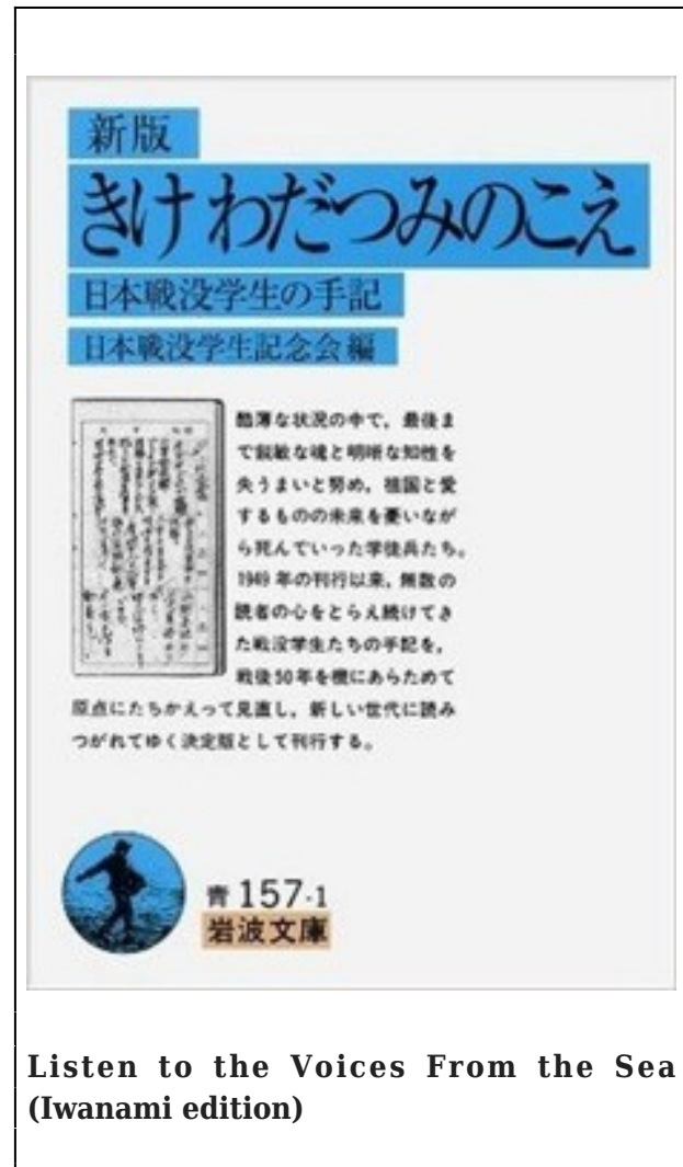
Listen to the Voices From the Sea (Iwanami edition)

best-seller boasting total sales of several million copies. 8 I too remember being deeply moved when I read it as a child, and, and I saw the film version (1950, directed by Sekikawa Hideo).