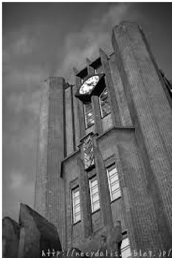
The clock tower at Tokyo University