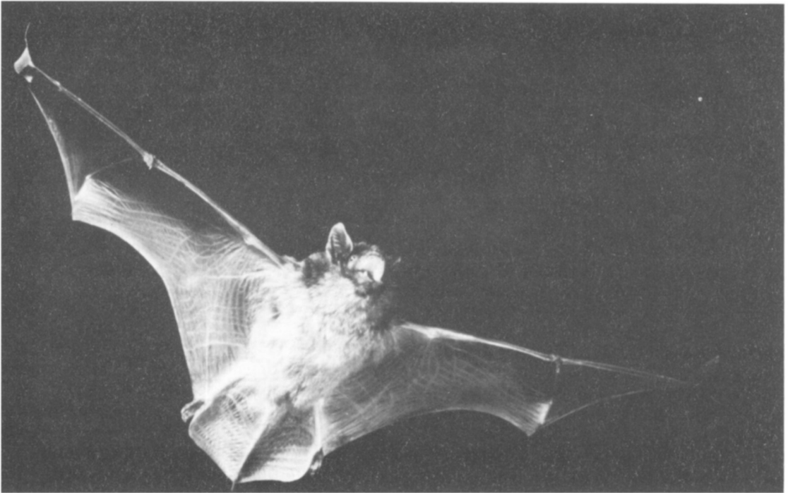
The serotine bat Eptesicus serotinus, one of the largest and most house-oriented bats in the UK, is the subject of a PhD study funded through the Bat Project.