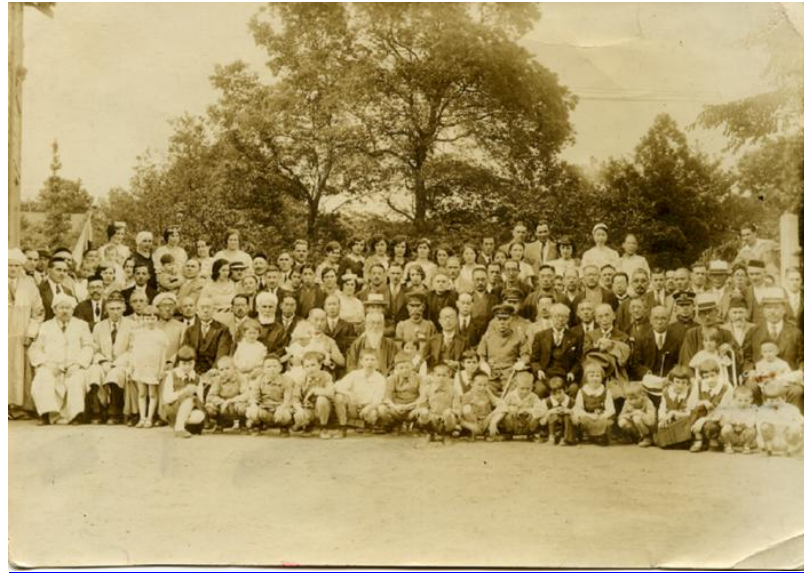
Pan-Asian gathering in Tokyo in the late 1930s (participants include Tōyama Mitsuru, a central figure in the Japanese nationalist movement, General Hayashi Senjūrō and Tatar pan-Islamist Abdurresid Ibrahim)

The use of pan-Asian ideology to legitimize war and Japanese colonial rule discredited the movement. As a result, Pan-Asianism came to be widely identified as an ideology of colonial rule—specifically, Japan's colonial rule over Asian countries and peoples, which, the Japanese rulers insisted, was more “benevolent” than Western colonial rule because Japanese were fellow Asians. Yet, as much recent research has shown, Japanese colonial rule was as