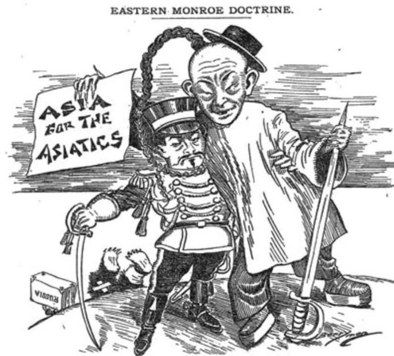
The Asian Monroe Doctrine

The assertion of racial and cultural commonalities presented here went hand in hand with the legitimization of Japanese superiority on the grounds that Japan was a country chosen by the gods. As early as the late 1910s, a number of writers, such as Kanokogi Kazunobu, Kita Ikki, and Ōkawa Shūmei, spoke of a divine Japanese "mission" to liberate Asia. This high-sounding objective was often difficult to distinguish from the substitution of one form of colonial oppression (by Europeans) for another (by fellow Asian Japanese). And a belief in Japan's divine mission was by no means limited to radical reformists. Even mainstream writers who eschewed ideologically driven rhetoric and sought to explain international relations in terms of Realpolitik, such as Tokutomi Sohō (1863-1957), urged Japan to establish an "Asian Monroe Doctrine." In doing so, Tokutomi may have been applying an idea of Western provenance to international relations in East Asia, but he still believed, like Kita and Kanokogi, that Japan had a special "mission" to accomplish in East Asia.