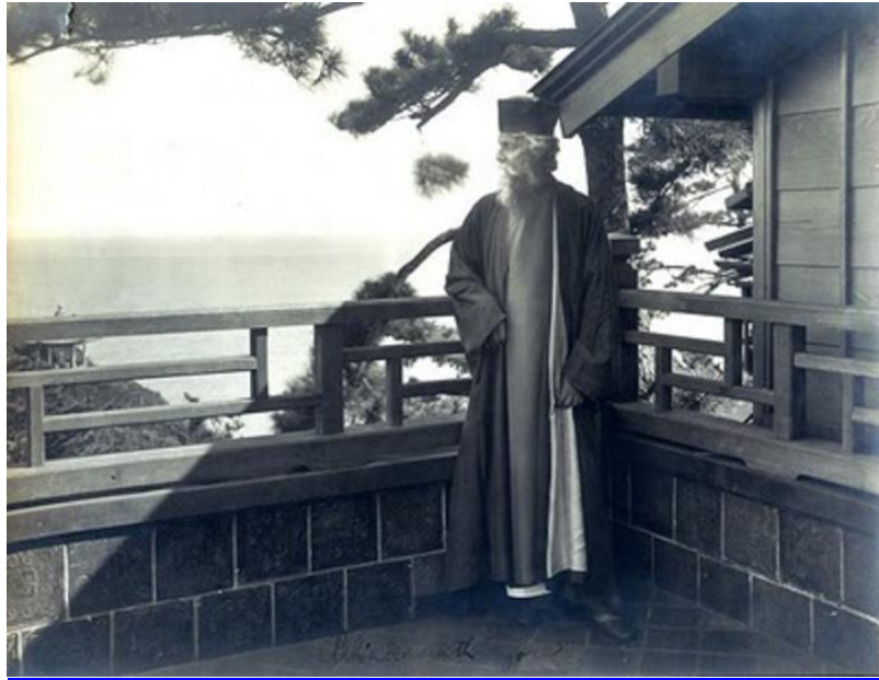
Rabindranath Tagore in Japan, 1916

South East Asians became suspicious of Japanese Pan-Asianism only in the late 1930s—much later than the Koreans and Chinese. The main reason for this was, unlike in Korea and China, the Japanese were not perceived as a threat to a region dominated by the Western powers. Consequently, Japanese-directed Pan-Asianism enjoyed great appeal throughout Southeast Asia. In the Philippines, Japanese pan-Asianists