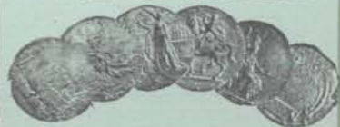
Gold Medal (Highest Award), Allahabad 1910.

GRANDS PRIX: Paris 1900, Brussels 1910, Buenos Aires 1910