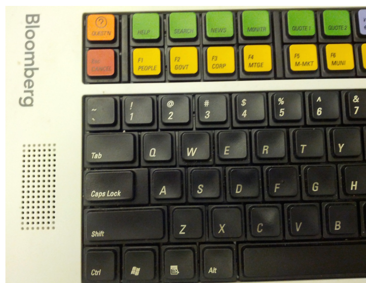
Figure 2. The Bloomberg Terminal keyboard.

The Bloomberg Professional service can be accessed through PCs, tablets, and smartphones, though its most iconic manifestation is through the Bloomberg Terminal, a dual-screen monitor with a fingerprint scanner and specialised, colour-coded keyboard that offers immediate access to areas such as EQUITY, NEWS, COMMODITY, CORP and GOVT. Although art investment has become an important asset class, there is no direct ART key.