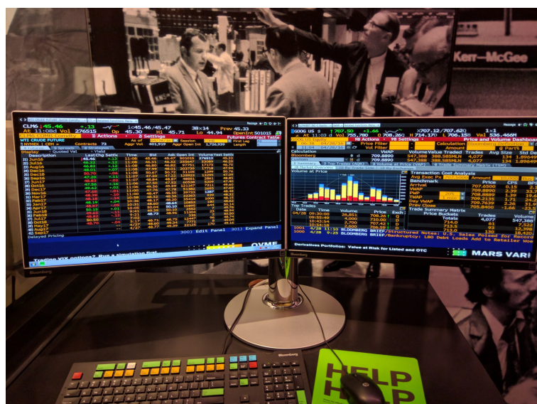
Figure 1. The current Bloomberg Terminal in a dual-screen configuration.

The Bloomberg Terminal, or more accurately, the online data and information services marketed under the banner of Bloomberg Professional, made its initial appearance in December 1982, and has become an enduring, even iconic, tool in the history of computing, to the extent that various models appear in Silicon Valley’s Computer History Museum and in the Smithsonian’s National Museum of American History (McCracken, 2015).