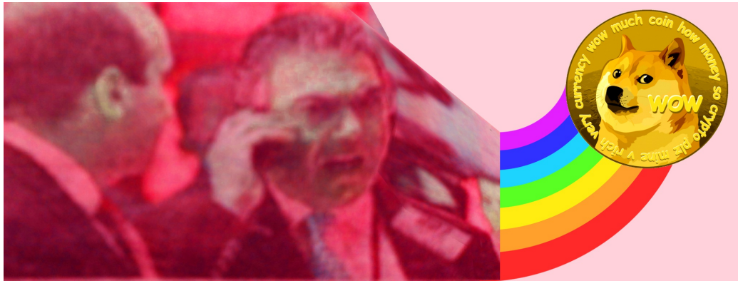
Figure 4. Image from ‘Changing the Image of Finance’ workshop, 2016.

This process was conceived as a prompt for critical thought, but also as a productive tool to create new images by combining existing ones. These new images provided a basis for conversation with multiple entry points, hooking people into an imaginative process in order to engage them to conduct critical conversations about art and finance.