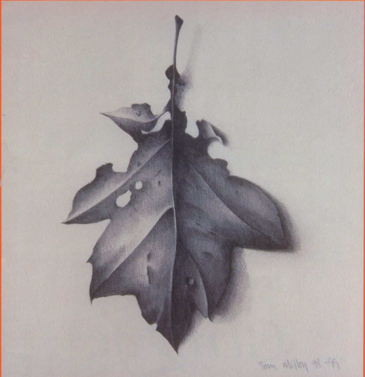
'Oak (detail)' by Tom Molloy 1998-99 (pencil on paper, 25 x 32cm) From the Collection at the Irish Museum of Modern Art, Royal Hospital Kilmainham, Dublin 8.