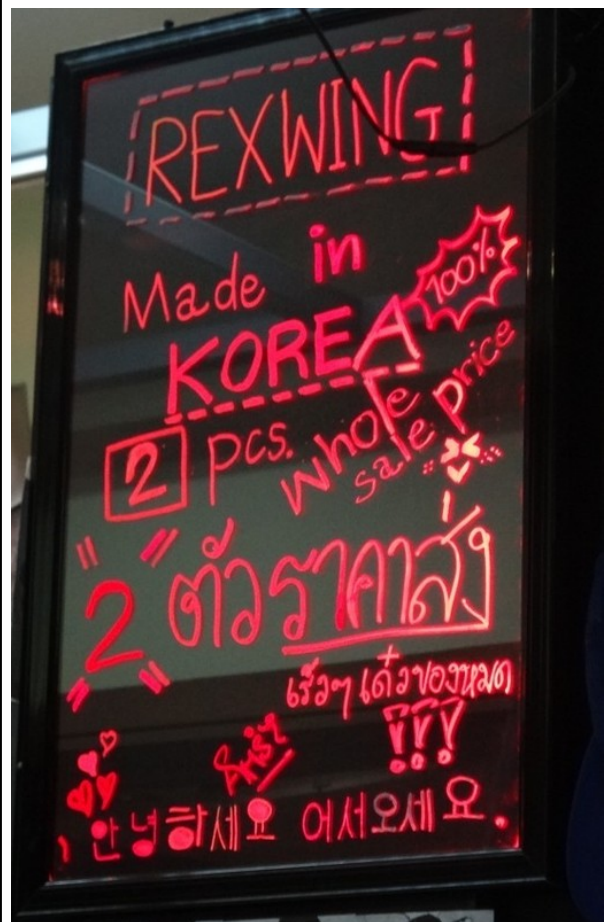
A shopkeeper advertises her product through its connection to Korea

How then do we explain the appeal of Hallyu in Thailand in the context of the social, economic and political changes occurring there at the same time? "The Thai consumer" is actually composed of inhabitants within a national hierarchy based upon class, ethnicity, geography and cultural positioning that constructs particular consumers pejoratively in relation to central Thailand and the Thai state. Consumer constructions of Korean products and Koreanness are most interesting because they show how people are trying to break down these divisions today.