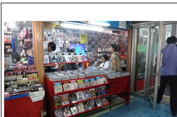
A typical Bangkok stall selling Korean TV Dramas on DVD

from across Thailand. These fans identified themselves to me, citing their familiarity with the latest Korean TV dramas, films, dress styles, music videos and stars as well as their collections of DVDs, magazines, clothing and other elements of Korean popular culture. Korean TV Dramas are the most widely accessible element of Hallyu and are consumed by a very diverse audience. Some things held true for all the fans, however. These dramas are particularly accessible due to their "universality" created by the focus on the familiar themes of love stories, family conflict and detective dramas; in addition, as Chua Beng Huat states, "television dramas engender sustained viewership and are, therefore, the most conducive site for audience reception research" (Chua Beng Huat, 2015). In addition, the fans found the dramas physically easy to acquire. They spoke of their ease in accessing the latest Korean dramas through cheap copied DVDs brought from Burmese border towns by local entrepreneurs. There was also no discernible difference between the dramas consumed by urban and rural viewers and all fans seemed equally happy to consume the latest Korean drama, with Dae Jang Geum having acted as a gateway into Hallyu fandom for a great many people in both groups.