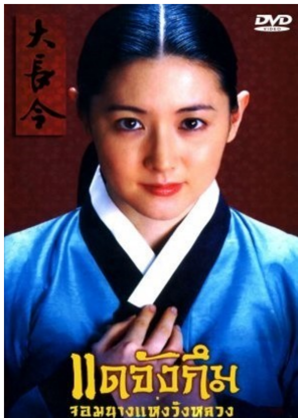
The Thai version of Korean TV Drama, Dae Jang Geum