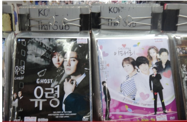
Korean DVDs on display with Thai subtitles

My interviewees fell into two groups: urban consumers in central Bangkok and people in the culturally and economically very different rural North-eastern Chaiyaphum province. While this rice-farming province is dominated by an agrarian economy and its inhabitants are ethnically and culturally Laotian (and speak a Laotian dialect rather than central Thai), it is also a relatively affluent province in the wider context of the Northeast with a low level of poverty and a substantial and growing rural middle class since the economic recovery in the mid-to-early 2000s. Chaiyaphum is therefore undergoing a shift in its relationship to the capital Bangkok. While Bangkok's central Thai hegemony was previously promoted as an aspirational "norm" by Thai elites, Chaiyaphum's opposition to this is particularly evident in its significant show of support for the red shirt movement, a protest movement which organises large demonstrations against the military rule that Thailand has endured at various intervals since the 2006 coup. 1