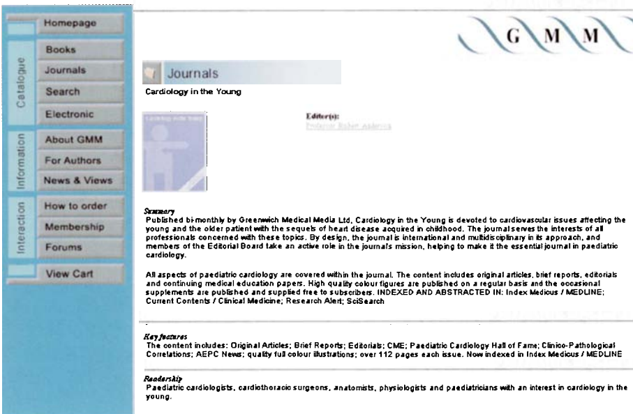
Figure 2. The Journal page within the site. From this page the user can access Table of Contents, Abstracts, Instructions to Authors and full on-line ordering details.