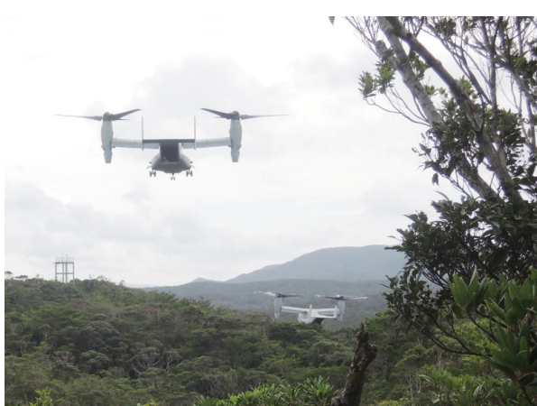
MV-22 Osprey terrain flight training in the Yanbaru forest.

We understand that, under the current U.S. National Historical Preservation Act (NHPA)(Section 402), the law that addresses matters related to the World Heritage Convention, while the U.S. military is required to take into account the effects of its undertakings, whether training or construction of facilities, on World Heritage sites and properties in foreign countries, it is not required to do so in relation to World Heritage inscription processes including one for the Yanbaru forest. We believe, however, that the spirit and intention of the NHPA is for the U.S. military to take into account the effects of allowing construction of landing zones and training on the Yanbaru forest, given that the Yanbaru forest is a World Natural Heritage candidate site and is now undergoing inscription process