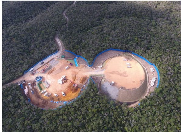
Landing zones under construction November 2016.

Meanwhile, since 1957, when 7,800 ha (19,274 acres) of the Yanbaru forest was taken over by the U.S. military and converted into the U.S. military's Northern Training Area, the U.S. military has been conducting jungle warfare training and low flying training of aircraft there. There are 22 (plus 2 newly constructed) landing zones for military aircraft and other training facilities in the NTA. Loud noise emitted from aircraft, land contamination from disposed materials and crashed aircraft, combined with logging and construction of logging roads by local forest industry, have presented and continue to present significant environmental challenges to the Yanbaru forest. The current construction of landing zones now adds to those challenges.