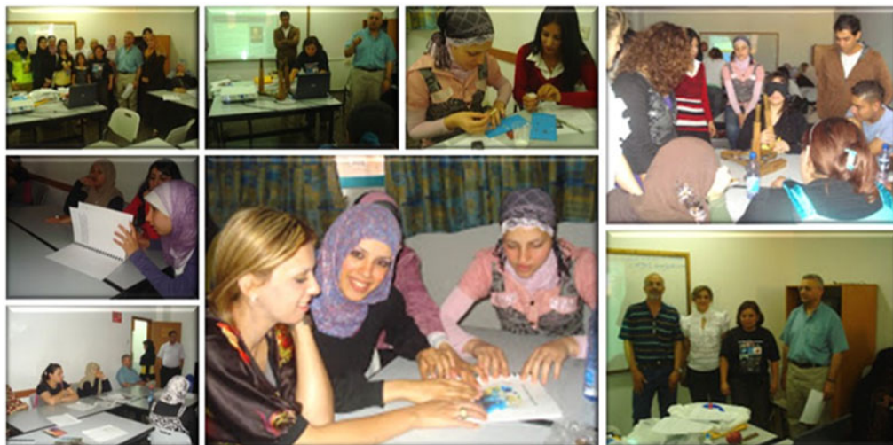
Figure 1. Workshop in Israel.

blind people the opportunity to get the conceptual idea of the specific topic under consideration. For other cases we have used available commercial materials to aid in the description of concepts like relief drawing paper, Braille books, Braille paper and stylus, among others. We have used available educational materials like the ALMA 12-Meter Antenna Paper Models from the National Astronomical Observatory of Japan (NAOJ 2021). We constructed 66 paper models of the ALMA antennas and organized inclusive events for their use. We designed a model of the Arecibo radio telescope that can be assembled, with the purpose of making blind people, together with their family or friends, to participate in the visit to the Arecibo Observatory radio telescope. The model integrates mathematical concepts in its structure, and is accompanied by three “Visitors Guide” booklets, printed in large print, in Braille, in Spanish and English (Bartus et al. 2007). We are saddened by the news of the recent collapse of the radio telescope.