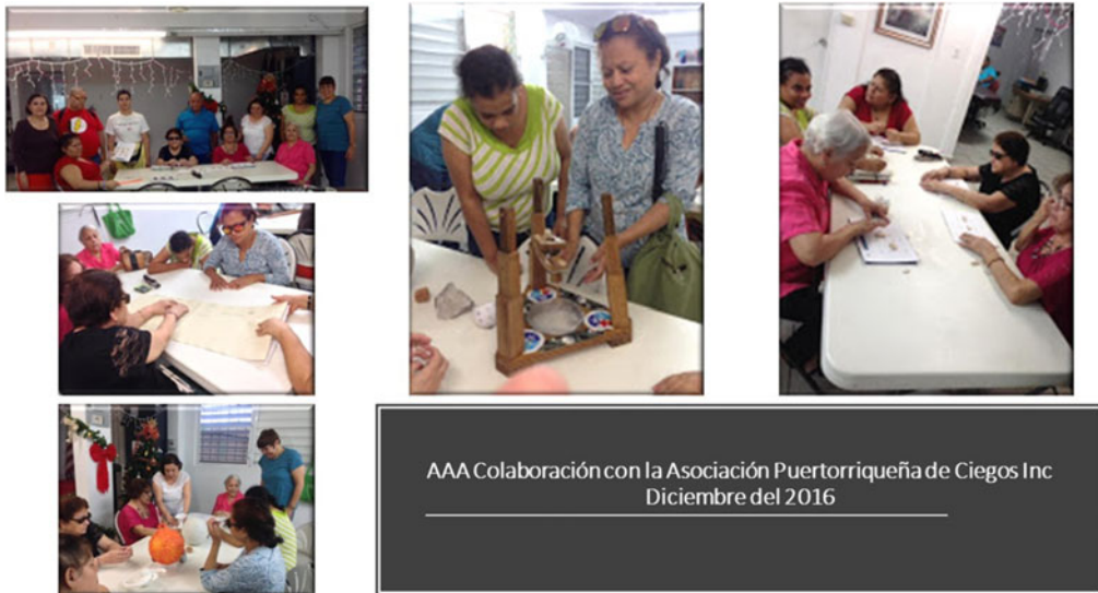
Figure 3. "Asociación Puertorriqueña de Ciegos"