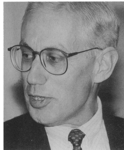
APSA President Arend Lijphart of the University of California, San Diego's Presidential Address, "Unequal Participation: Democracy's Unresolved Dilemma," will appear in the March 1997 issue of the American Political Science Review .

tics: Understanding Senate Voting on GATT and NAFTA in 1993–1994