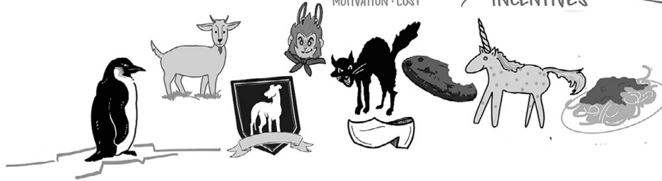
FIGURE 3.1 Visual themes related to everyday misinformation.