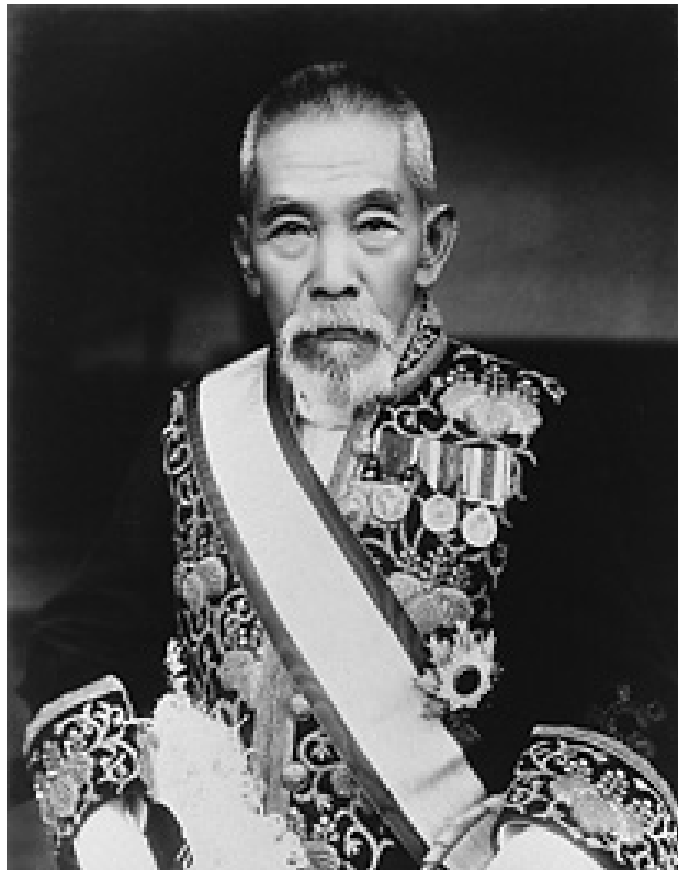
Inukai Tsuyoshi, Ogata's maternal grandfather served as Prime Minister

of human rights that recommended her to Boutros-Ghali's office in New York.