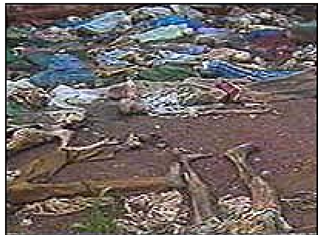
Victims of Rwandan massacre

of up to 800,000 predominantly Tutsi civilians in Rwanda. One million mainly Hutu refugees moved into what was then Zaire in 1994, and UNHCR immediately appealed for military help. French troops were there from the start, shortly followed by US Army logistical support—Operation Support Hope—then Swedish and German troops, and the Japanese Self-Defence Force (a minor breakthrough in Japan's remilitarization, which Ogata celebrates). Setting up and running the camps required the support of Mobutu's regime, which he gave with a view to strengthening his hand in the region and in international negotiations. [7] Ogata argued that 'From the outset it seemed obvious that return was the main solution. The refugee outflow was too massive for the people to be absorbed by neighbouring countries or to be resettled in third countries.' [8] This policy was now becoming so entrenched that it no longer seemed necessary for UNHCR even to ask whether repatriation was in the best interests of the refugees. Sporadic massacres of displaced civilians within Rwanda seem only to have slightly delayed the apparently inevitable return.