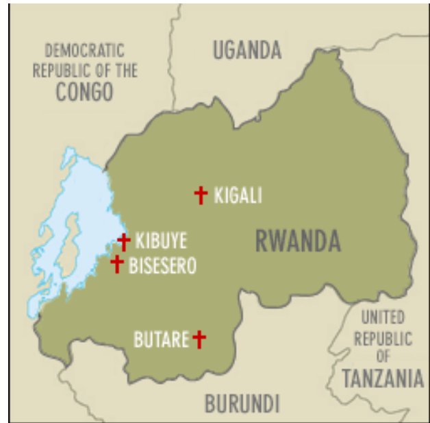
The landscape in Rwanda is littered with massacre sites

By November 1996, Rwandan forces and the Banyamulenge had joined with Congolese rebel groups to form the Alliance of Democratic Forces for the Liberation of Congo (ADFL). Aiming ultimately to topple Mobutu's regime, and so viewing the refugee camps as a local threat, the ADFL attacked more of the camps. Half a million refugees were forced to converge in one small volcanic area in Goma, with no more than a few hundred UNHCR staff trying to arrange sanitation, food and water. At the worst point, three thousand people were dying every day. [10] Pressure mounted on the UN to act, and Canada offered to lead a multinational force. Rwanda and the Congolese rebel forces moved quickly, with likely US connivance, to make sure that an international military presence would not impede their war aims. Rwandan Vice-President Kagame ordered attacks on camps in Mugunga with rockets, mortar and heavy artillery, forcing half a million refugees in the direction of Rwanda. The UNSC resolution ordering a deployment was passed the next day, but Kagame had ensured that it would not take effect: the camps it was to protect had been dispersed. He also