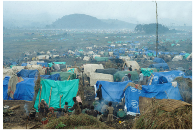
Refugee camp in Zaire

the Convention with apparent impunity. The UN itself has estimated that, during 1996–97, two hundred thousand Rwandan refugees were killed in Zaire. [16]