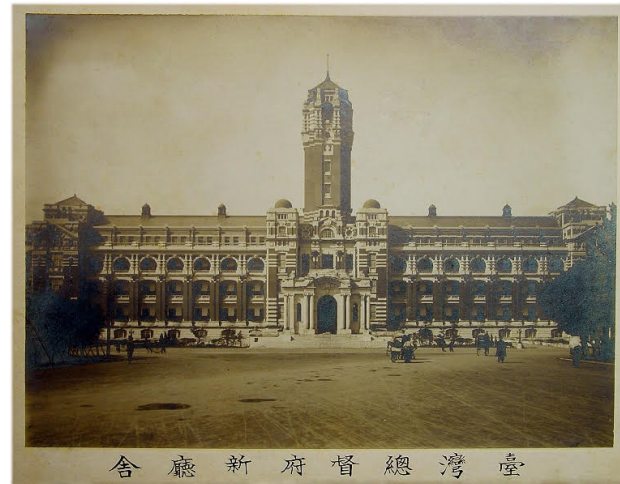
Figure 2: The Taiwan Government-General headquarters in the colonial capital of Taipei, 1919. The European Baroque-style building was over 400 feet wide with an imposing eleven-story tower in the center 200 feet long, symbolic of the Government-General's power.

Other colonies among the Western empires served as imperial gateways too, and their histories can help throw Taiwan's into further relief. For example, India, which served as Britain's entry point for the Middle East and Indian Ocean regions, possessed more institutional autonomy and greater economic and military power than Taiwan. The Indian Government-General presided over the Indian Army, the British empire's largest force, consisting of majority Indian soldiers and financed by colonial revenues. The Indian Army led incursions in the Middle East, Africa, and Asia, and the resulting acquisitions—the Straits Settlements, Aden, and Burma, among others—were placed under India's jurisdiction for several decades, until they became separate colonies supervised by the Colonial Office in London. 46 Taiwan, by contrast, never possessed its own independent army or foreign office and remained subordinate to directives issued by Tokyo's Imperial Army and Foreign Ministry in its international relations. Yet even with far less manpower and resources than both Korea and India, the Taiwan Government-General helped shape the trajectory of Japan's southern expansion through its use of overseas Taiwanese as gateway subjects.