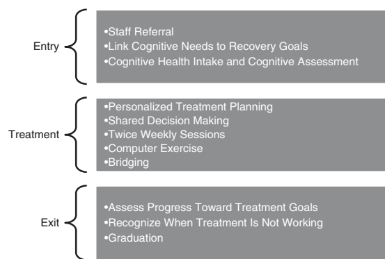
FIGURE 2. CR2PR treatment model.

The CR2PR treatment phase generally consists of 30 sessions conducted twice weekly, although length of treatment can be tailored to individual needs. Clients are asked to commit to attending blocks of 10 sessions that are conducted in groups of 6–8 participants. Each session is 60 minutes, including 45 minutes devoted to restorative web-based cognitive training exercises and 15 minutes of bridging group discussion. Admission to the group is on a rolling basis, and during the computer exercise portion of the session, participants work at their own rate on exercises identified as useful to them based on their assessment and recovery goals. One clinician leads the group.