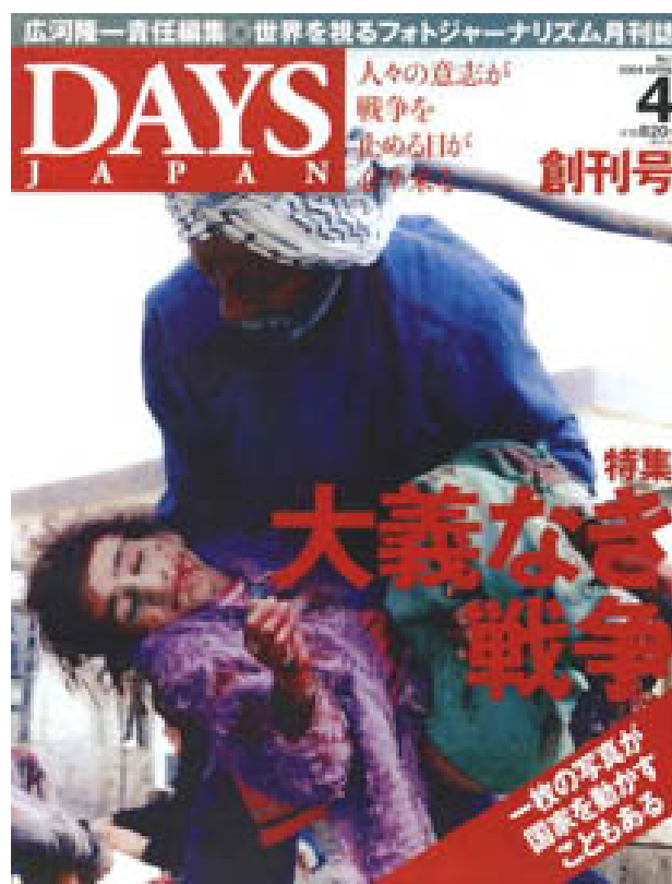
The cover of DAYS Japan , inaugural issue (April 4, 2004).

of pain and sadness coming from the Iraqi people, and the footsteps of war that are approaching Japan? The plaintiffs and the attorney before you can hear them clearly. We have brought this lawsuit with the urgent desire of stopping this development. It is truly a shame that the court has not admitted the testimony of witnesses and Plaintiffs, but the Plaintiffs have submitted extensive documentary evidence. We ask that the court read all the documentary evidence and take the time to confront, in silence, this photograph of a bloodstained girl. And please do not hand down a decision along the lines of the Kofu District Court decision, as argued by the State. That self-abnegating decision might as well be deemed a suicidal act on the part of the Court.