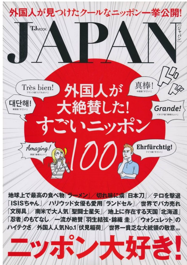
JAPAN: Rave Reviews by Foreigners! Great Japan 100 (Takarajimasha 2015)