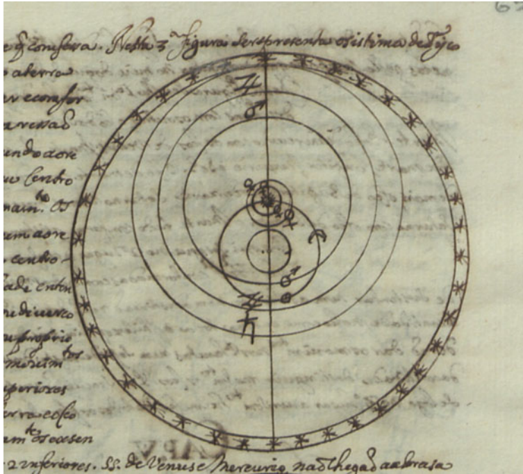
Figure 2. Tycho Brahe's planetary system according to Johann Chrysostomus Gall, Tratado sobre a e[s]phera material, celeste e natural... em Lisboa no anno de 1625 , Biblioteca Nacional de Portugal, COD. 1869, fol. 65r.

praised by our Clavius, who called him alterum Ptholomeum e[t] restitutorem astronomiae egrerium . 64