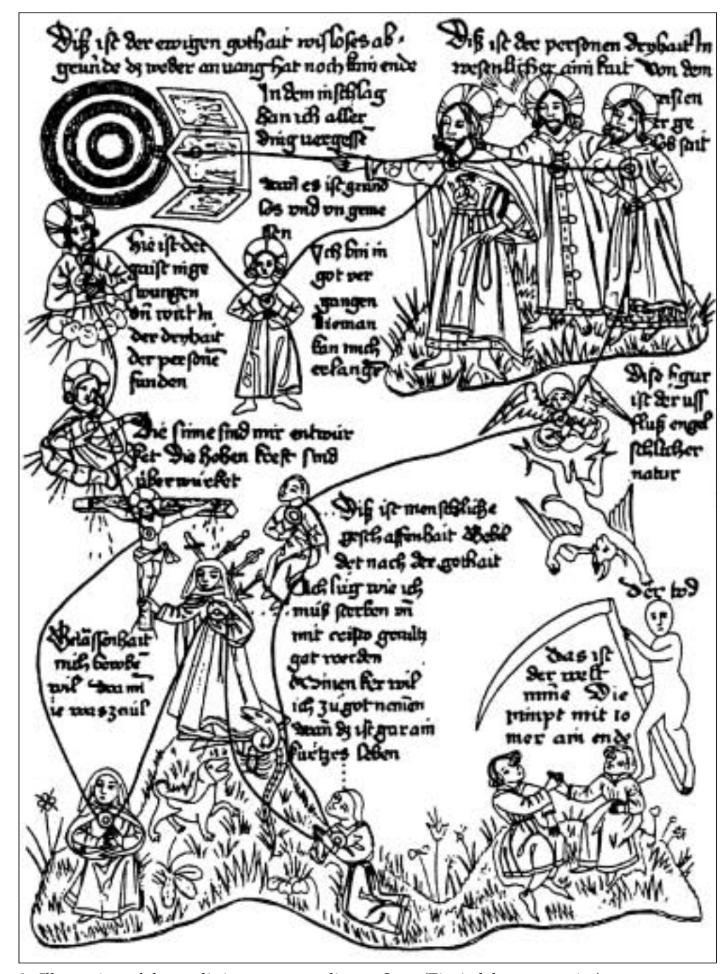
2. Illustration of the soul's journey according to Suso (Einsiedeln manuscript)