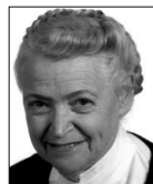
Mildred S. Dresselhaus

Mildred S. Dresselhaus of the Massachusetts Institute of Technology received the 11th Heinz Award for Technology, the Economy, and Employment in recognition of her contributions as a scientist, researcher, educator, and trailblazer for women in the sciences. An MIT professor and researcher for more than four decades, Dresselhaus is recognized by the Heinz Award as one of the United States' foremost experts in the multifaceted field of condensed matter and materials physics. Her investigations into the electronic properties of graphite, the structure and properties of novel forms of carbon, thermoelectricity, and the new physics at the nanometer scale have significantly advanced these fields, while at the same time, she has worked to break down stereotypes and expand opportunities for women in science. She has lectured around the world, written extensively about her research and served in prominent leadership roles, including as director of the Office of Science at the U.S. Department of Energy and as president of