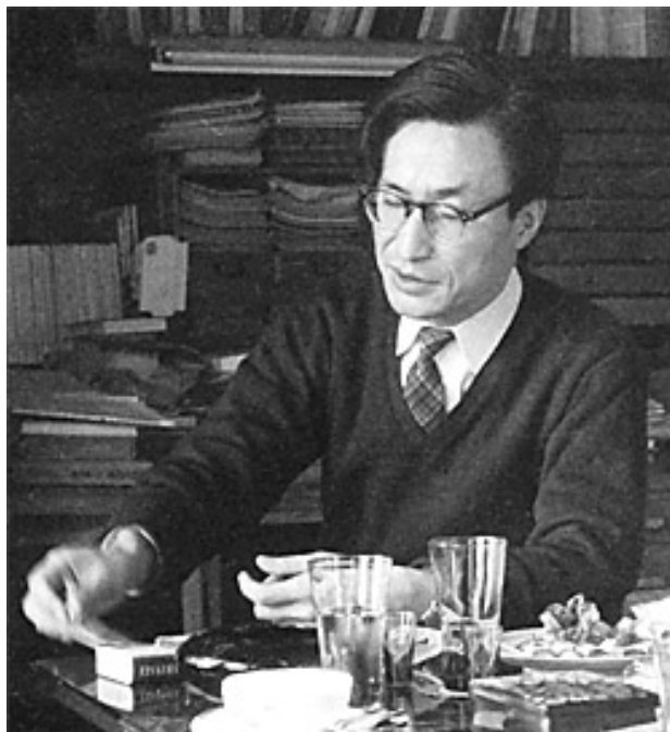
Maruyama Masao, 1959

mentality, as well, beginning with intense rivalry among, and nepotism within, the Army, Navy, and civilian bureaucracy. These realities of wartime society were a far cry from the ideal types of modern rationalism that were envisioned by intellectuals. Moreover, owing to the democratization policies of American occupation forces under the command of General Douglas MacArthur, the supposedly “overcome” ideal of liberal democracy experienced a revival.