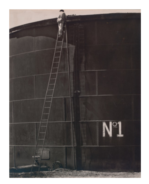
Figure 2 Tina Modotti, Oil Tank, 1927. Located in central Mexico.

The investments in the logistical circuits of petroleum and the urban reinvestments of surplus oil revenue, together, have shaped the political economy of the global petroleumscape. It is crucial to think comparatively across broadly synchronic patterns of petroleum-driven urban industrialization and consider the ways internal (that is, national) racial power structures have intersected with fossil energy regimes to create different levels of material prosperity. Energy historian Germán Vergara points to the causative relationship between the siting of pipelines, refineries, and other fossil fuel infrastructure, on the one hand, and the levels of urban prosperity and industrial development that fossil fuels, especially petroleum, fostered across central and northern Mexico, on the other (Vergara 2021) (see Figure 2). Mexico's petroleumscape was not an accident of geography but itself a product of decades, if not centuries, of uneven economic development and a racial regime that favored the putative rationality of mestizaje and whiteness in northern and central Mexico over the irrationality and backwardness of Mexico's Indigenous south. While there is a general dearth of work on this aspect of the global petroleumscape, we might consider the energetic bases of unequal regional and national development in other nationstates with their own historical fossil fuel reserves. In Brazil, the industrializing south was supplied with petroleum from the poorer Afro-Brazilian north around