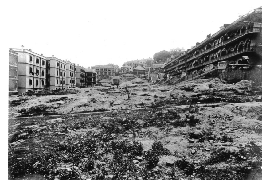
Figure 1 Destruction of housing in the Tai Ping Shan area, Hong Kong, 1895.

established other urban Improvement Companies, all with similar objectives across their possessions at the time of the plague. Historian Sheetal Chhabria locates the origins of the modern slum in these anti-plague campaigns, and calls its physical and symbolic creation "a case of a solution finding its problem rather than the other way around" (Chhabria 2019: 181). Upon the plague's arrival in Honolulu in 1900, American officials viewed Chinatown as an imminent danger to the health of white American residents. They debated Bombay and Hong Kong's plague responses, settling on what Hong Kong authorities had ultimately rejected: fire. Winds swept through the city during one controlled burn, torching all of Chinatown. Residents were then forced into plague camps outside the city and kept under armed guard for months. The following year, upon the mere hint of plague entering San Francisco, police forbade movement to and from Chinatown while the city's press stoked fears of plague-carrying Chinese wandering the city (Shah 2001; Echenberg 2007; Nightingale 2012).