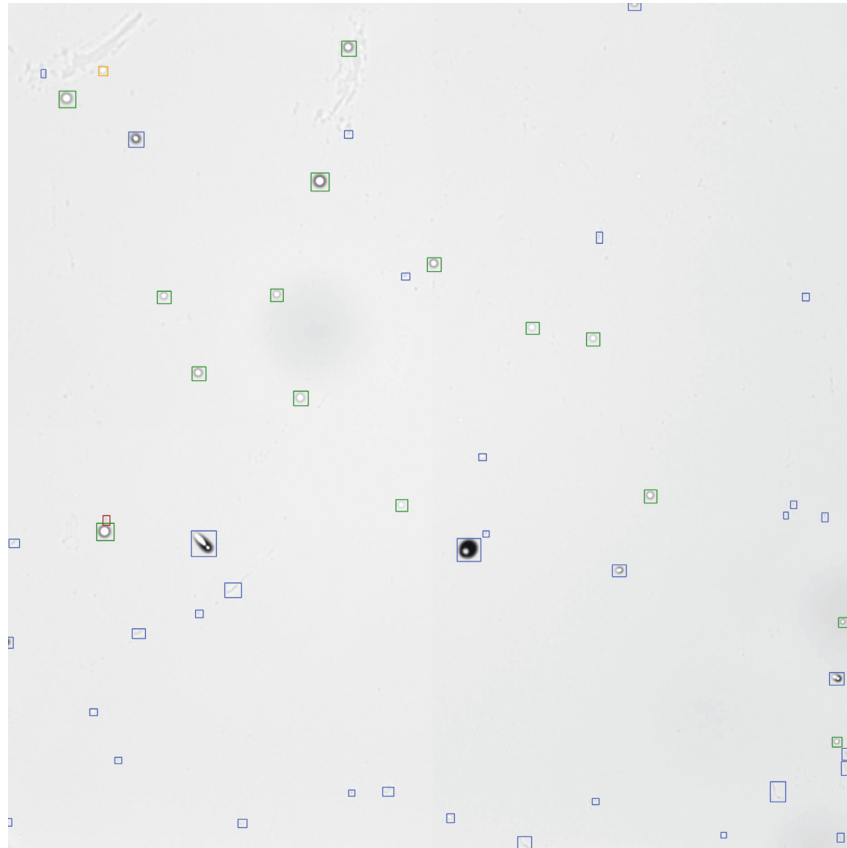
FIGURE 3: An example of FAINE tagging signs inside a CR-39 image. Green squares indicate true positives, blue squares indicate true negatives, red squares indicate false positives, and orange squares indicate false negatives.