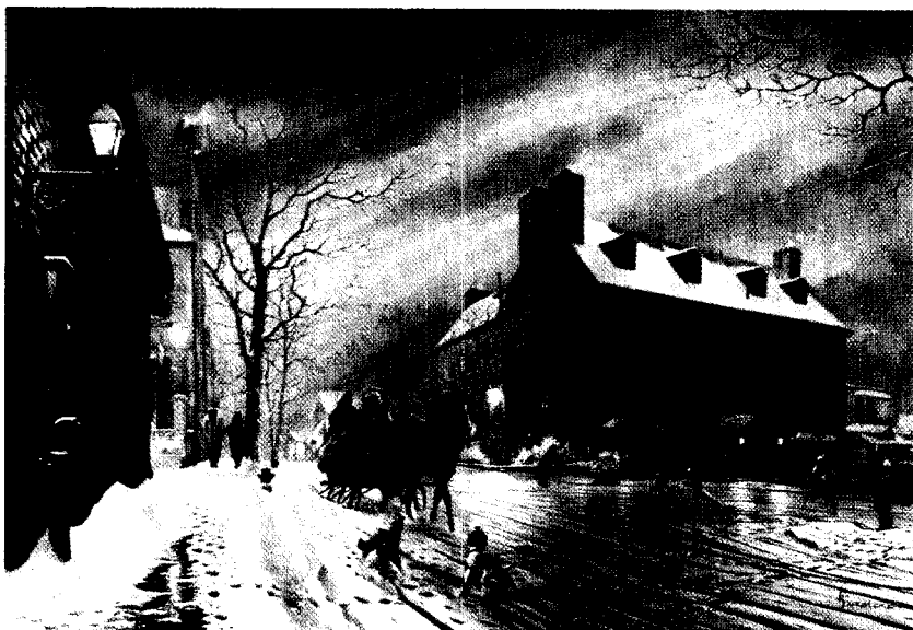
By The Levee