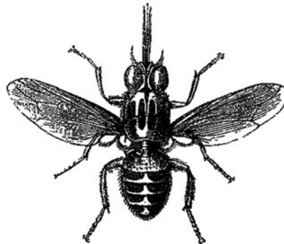
Tsetse Fly. —Magnified.—See p. 571.

FELLOW OF THE FACULTY OF PHYSICIANS AND SURGEONS, GLASGOW; CORRESPONDING MEMBER OF THE GEOGRAPHICAL AND STATISTICAL SOCIETY OF NEW YORK; GOLD MEDALLIST AND CORRESPONDING MEMBER OF THE ROYAL GEOGRAPHICAL SOCIETIES OF LONDON AND PARIS, F.S.A., ETC., ETC.