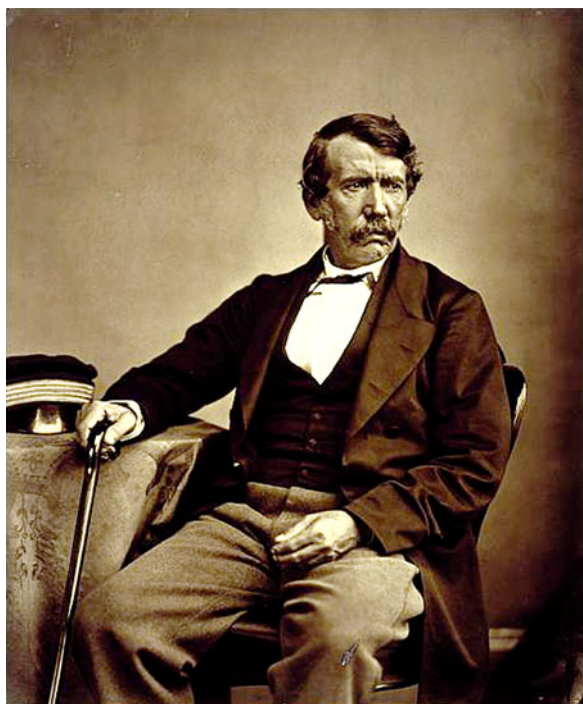
Fig. 1. David Livingstone, photographed by Thomas Annan in 1864. Used by kind permission of Flickr The Commons.