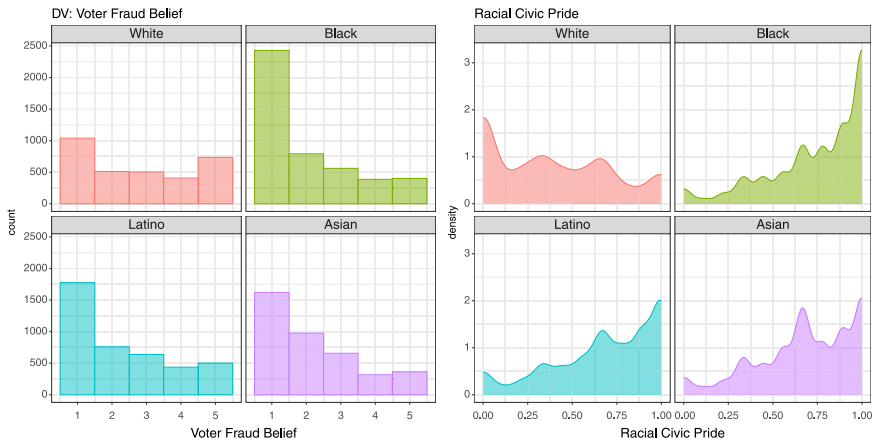
Figure 1. Distribution of voter fraud beliefs (left) and racial civic pride (right).

Similar contrasts emerge between White and non-White respondents when examining racial civic pride. Non-White respondents demonstrate high levels of racial civic pride, with most concentrated at the higher end of the distribution. Black respondents exhibit the highest level of racial civic pride with an average score of .75, followed by Latino (average .68), Asian (average .67), and White (average .39) respondents. White respondents have a distinctively lower mean value compared to other groups. The racial civic pride index for White respondents is not as concentrated as that of non-White respondents. While the mode of the distribution for White respondents is at the lowest point of racial civic pride, there is also a significant cluster of respondents in the middle of the distribution.