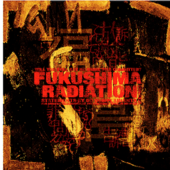
Fukushima Radiation: Will You Still Say No Crime Was Committed? Statements by 50 Complainants for the Criminal Prosecution of the Fukushima Nuclear Disaster (ebook, 2015)