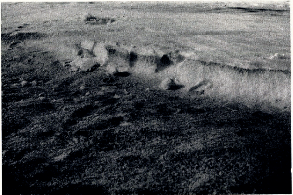
Fig. 2. Close-up view of snow-drift to show differential ablation due to wind-blown dust. 8 June 1960