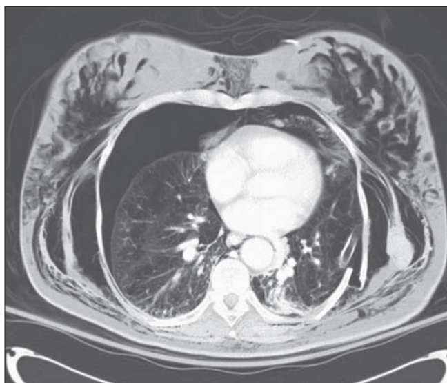
Fig. 3. Noncontrast CT scan of chest also showing bilateral pneumothoraces with shift. The thoracostomy tube is present on the left, and the displaced posterolateral rib fracture is seen on the left. Subcutaneous emphysema is tracking through multiple planes.