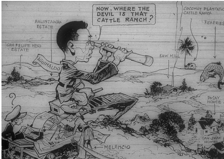
Figure 2. Editorial cartoon depicting Aguinaldo searching for Quezon's supposedly questionable properties