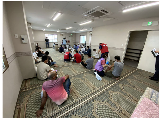
Figure 1. People receiving vaccinations on the third floor of Ebina Mosque (doctors, nurses, and paramedics wore scrimmage vests).

There were two notable aspects of vaccination at the mosque: multilingual support and gender support. For multilingual support, medical questionnaires in Japanese and English were available. Confirmation and questions about vaccination precautions (i.e., history of anaphylaxis) in Japanese, English, Tamil, Urdu, Sinhalese, and Bengali were also posted at the reception. Furthermore, three or four interpreters conversant in several foreign languages were on standby. They could interpret Japanese into not only English but also Bengali, Tamil, Sinhala, and other languages. The interpreters were all volunteers from among the daily worshippers as well as the mosque representative and imams. They interpreted beside the doctors during the initial group explanations and the individual medical interviews. Additionally, vaccine