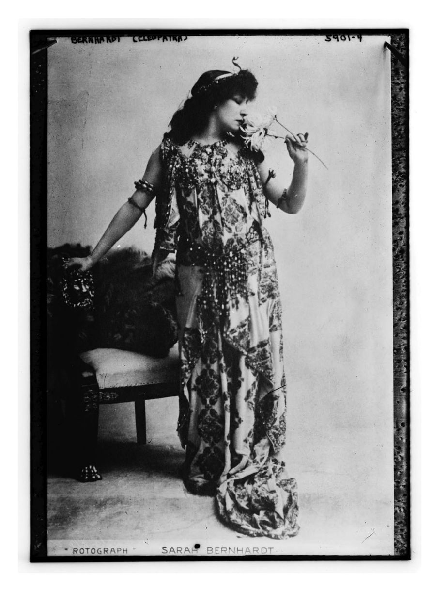
Figure 12. Napoleon Sarony, Portrait of Sarah Bernhardt as Cleopatra, 1891.

47). Bernhardt was in her late forties when she went into rehearsal for Salomé at the Palace Theatre in 1892, far too old to play the role of the pubescent girl, not to mention the dance of the seven veils. Bernhardt readily accepted the role, probably perceiving "the particular camp appeal of a middle-aged woman portraying (or trying to 'pass' as) a nubile princess," as Garelick also notes (149). By the late 1880s, Bernhardt was notorious for her narcissistic performances without giving proper characterization of her role (Figure 12). The plays were