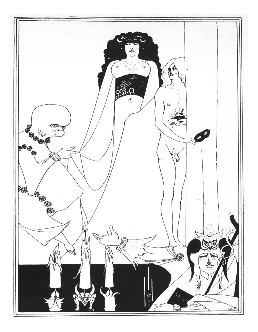
Figure 11. "Enter Herodias." Illustration by Aubrey Beasley from Oscar Wilde's Salomé (London, 1894).

play involves a "duplicity"; "Behind the 'straight' public sense in which something can be taken, one has found a private zany experience of the thing" (Sontag 281).