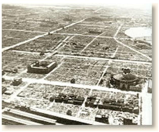
Central Tokyo in ruins after the March 10 firebombing

The aim was to cause maximum carnage in an overcrowded city of flimsy wooden buildings; an estimated 100,000 people were 'scorched, boiled and baked to death,' in the words of the attack's architect, General Curtis LeMay. It was then the single largest mass killing of World War II, dwarfing even the destruction of the German city of Dresden on Feb. 13, 1945.