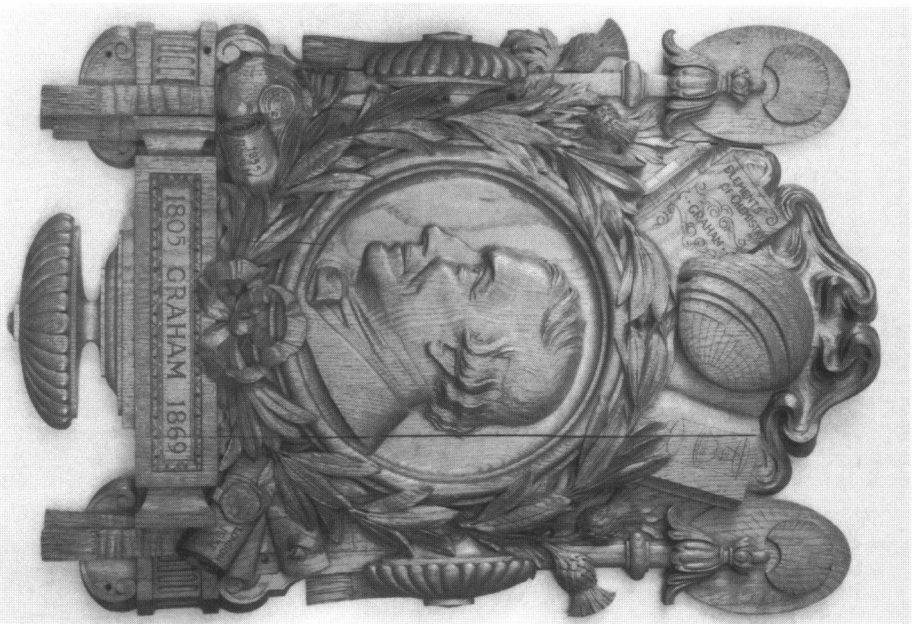
Plate 1: Wood carvings in the Colman Library, Dunn Institute of Biochemistry, University of Cambridge: (left) John Mayow; (right) Thomas Graham.