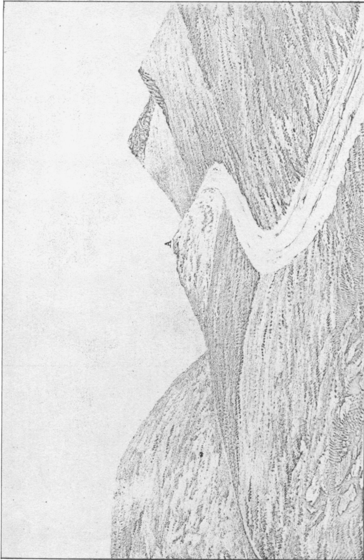
Mount of Sapiro, seven miles West from Bellary. Drawn by Isaac F. Lambart, Machine Engineer (A, represents the Mount.)