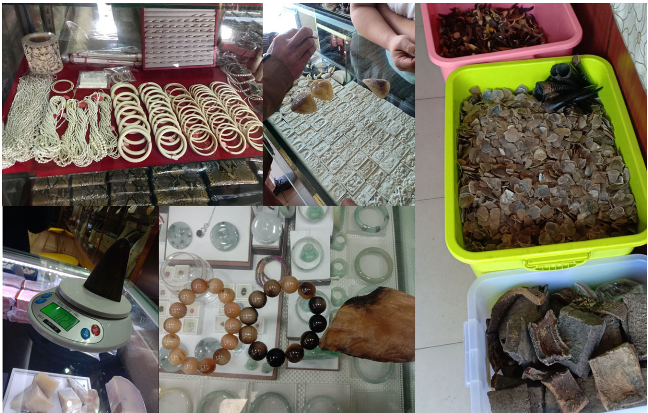
Fig. 2. Wildlife products for sale in two border market towns in Myanmar in 2020. Clockwise from top left, in Tachilek: elephant ivory jewellery; and in Mong La: carved pangolin scales on top of a display cabinet with elephant ivory pendants; boxes with (1) muntjac antlers, (2) pangolin scales and serow horns and (3) dried elephant skin; rhino horn bead bracelets and a piece of raw rhino horn (bottom right); rhino horn tip on a scale.

residents are Chinese. Mandarin/Putonghua is spoken widely in Mong La, signs are in Chinese characters and the mobile phone network and electricity providers are Chinese. The Chinese