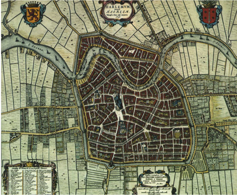
Figure 2. Historic map of Haarlem, 1652