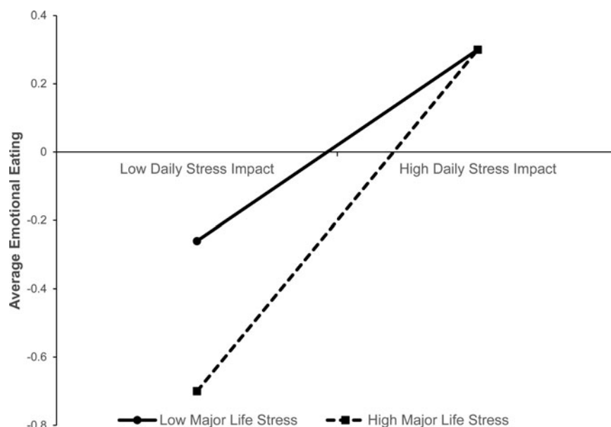
Fig. 1. Two-way interaction between average daily stress impact and major life stress in the last 12 months. ‘High’ and ‘low’ values represent 1 s.d. above and below the mean on major life stress and average daily stress impact, respectively.

Birgegård, 2013; Palmisano, Innamorati, & Vanderlinden, 2016; Smyth, Heron, Wonderlich, Crosby, & Thompson, 2008; Zelkowitz, Zerubavel, Zucker, & Copeland, 2021). Because we did not assess trauma specifically, we were unable to examine whether the trauma was more closely associated with EE than