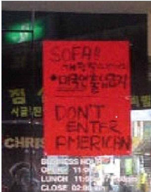
Figure 2: Anti-Americanism in Korea, 2002 The sign reads: "Until the Status of Forces Agreement (SOFA) is revised, Americans are barred from entering."