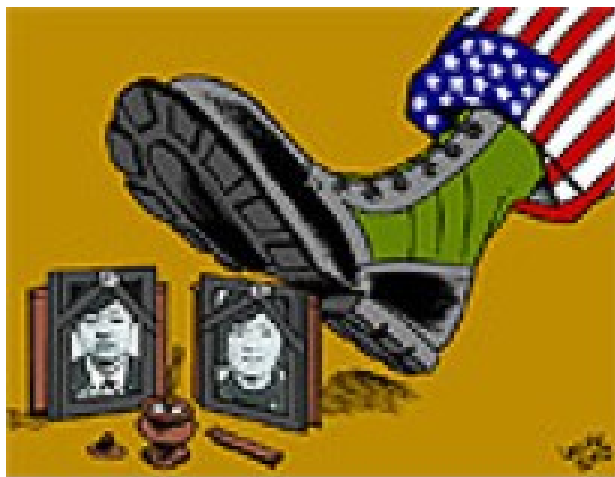
Figure 1: Cartoon depicting the U.S. trampling