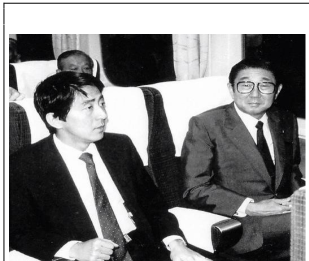
A young Abe Shinzō with his father, Shintarō

greater inspiration. Abe Shintarō was Japan's foreign minister from 1982 to 1986 and was therefore in office during the positive period in Soviet-Japanese relations that followed Mikhail Gorbachev's accession to general secretary in March 1985. Encouraged by the optimistic atmosphere that accompanied the ending of the Cold War, Abe's father succeeded in opening negotiations with the Soviet Union. He also developed an affection for the country and set the target of signing a peace treaty during the lifetime of the current generation. Abe Shinzō has openly expressed his determination to complete this unfulfilled goal of his father (Abe 2006: 34-7). Most nostalgically, when in Moscow in April 2013, the Japanese prime minister visited the sakura garden that had been inaugurated by his father in 1986. On that occasion, Abe stated: "In accordance with the will of my father, I wish to achieve such development in relations with Russia that the cherry trees enter a period of full bloom" (quoted in Gusman 2013).