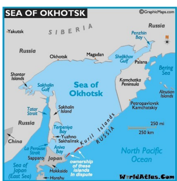
The Sea of Okhotsk, Russia's "last line of defense"

In addition to functioning as a side-door to the Sea of Okhotsk, the disputed islands are considered strategically important to Russia because of their location at the extreme end of the Northern Sea Route. The Russian government is eager to promote the commercial use of this alternative trade route between Europe and Asia. At the same time, however, the authorities are worried about the security implications of the Arctic waterways in proximity to Russia's northern coastline becoming increasingly accessible as a result of climate change. It is to a considerable extent in response to these security concerns that Russia has recently sought to accelerate its programme of developing a total of 392 military installations on Etorofu and Kunashiri. As announced in January by Defence Minister Shoigu, all of this military infrastructure is now expected to be complete by the end of 2016 ( Sankei Shinbun 2016).