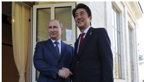
Putin and Abe meet in Sochi, February 2014