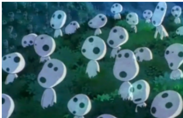
Kodama ©1997 Studio Ghibli

I wondered how to give shape to the image of the forest, from the time when it was not a collection of plants but had a spiritual meaning as well . I didn’t want the forest just to have many tall trees or be full of darkness. I wanted to express the feeling of mysteriousness that one feels when stepping into a forest – the feeling that something is watching from somewhere or the strange sound that one can hear from somewhere. When I mulled over how I could give form to that feeling, I thought of the kodama. Those who can see them do, and those who can’t don’t see them. They appear and disappear as a presence beyond good or evil. 53