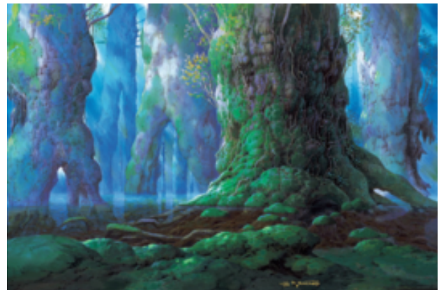
'The Forest of Shishigami no.5' in Princess Mononoke

The major characteristic of Studio Ghibli – not just myself – is the way we depict nature. We don't subordinate the natural setting to the characters. Our way of thinking is that nature exists and human beings exist within it . ... That is because we feel that the world is beautiful. Human relationships are not the only thing that is interesting. We think that weather, time, rays of light, plants, water, and wind – what makes up the landscape – are all beautiful. That is why we make efforts to incorporate them as much as possible in our work (emphasis added). 50