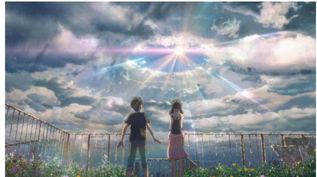
Spiritual Image in Weathering with You 44

reality in his films. The distance between the dead and the living is blurred or almost non-existent and the main characters are able to travel between both worlds in both Weathering with You and Your Name .