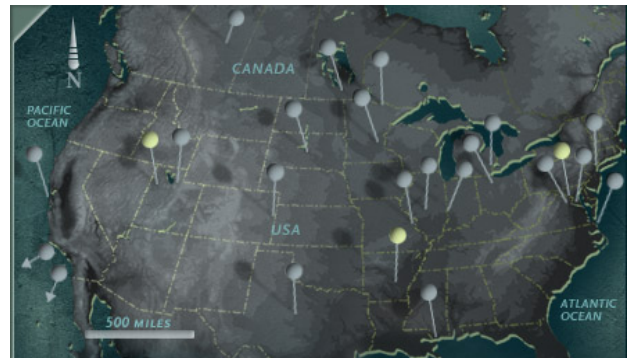
US bioweapons map, early 1950s.

recent years in the tale of possible American use of biological agents in the Korean War.[28] But the American appetite for such investigations is so low that the publishers of a celebrated British study of Unit 731 saw fit to excise the Korean War chapter highlighting U.S. collaboration with Japanese BW experts in Korea in the American edition of their work.[29]