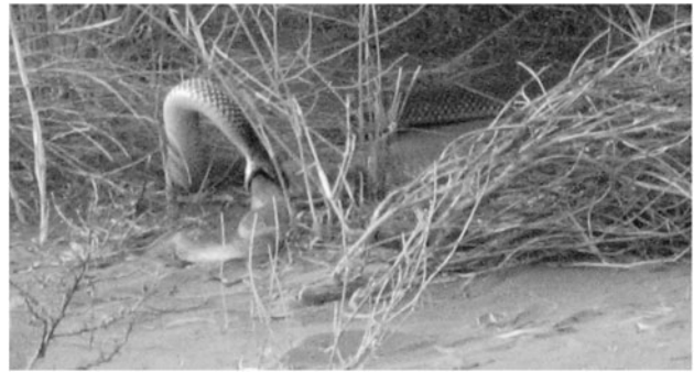
PLATE 1 Mulga snake Pseudechis australis biting a reintroduced woma Aspidites ramsayi at the Arid Recovery Reserve in South Australia (Fig. 1).

The most noteworthy outcome of this study was that all released woma pythons were dead between 41 and 123 days following release, either definitely or most likely killed by mulga snakes. Three python mortalities were attributed to at least two, probably three, different mulga snakes. Two of these womas were eaten by different mulga snakes that continued to be radio-tracked until they excreted their transmitters 33 and 23–27 days later. The other woma (#98) was observed being repeatedly struck and dragged around by a mulga snake but was not swallowed (Plate 1). Three other womas were most likely killed by mulga snakes that were observed entering woma burrows immediately before their death (#97) or they were located near death or dead with severe bruising and/or heart and lung damage consistent with mulga snake envenomation (#91 and #95). Two other womas (#93 & #96) were removed from burrows in a decomposed state several days after many snake tracks were observed at the burrow, consistent with the sign left by a confirmed mulga snake attack followed by regurgitation of the woma. The final woma transmitter (#99) was lost after it had moved widely on a swale for several days without being sighted, which was consistent with the movements of both mulga snakes known to have consumed womas (see below). We assume that this woma was swallowed by a mulga snake shortly before the long-distance movements of its transmitter commenced.