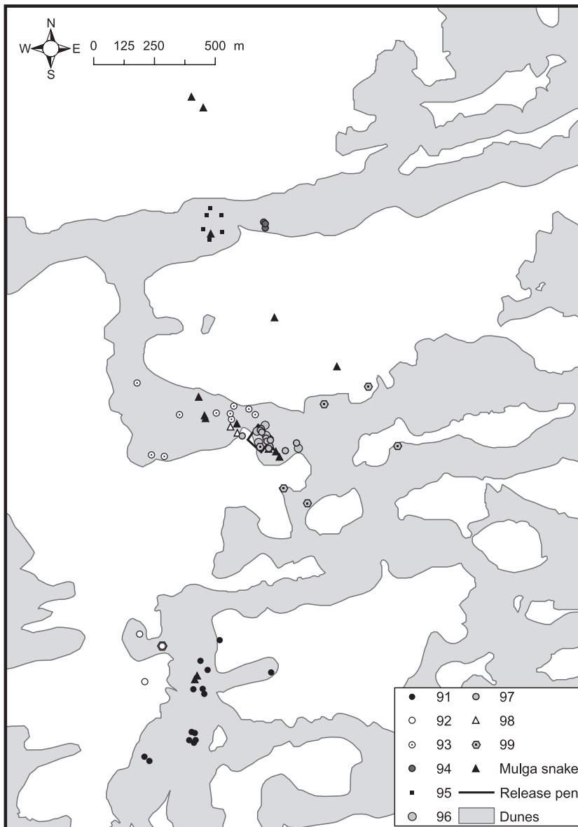
FIG. 1 Map of part of the Arid Recovery Reserve showing locations where nine woma pythons Aspidites ramsayi (#91–99), and subsequently mulga snakes Pseudechis australis that predated three pythons, were found.

P = 0.000 ), with rodent tracks ( 70.4 \pm SE 3.8\% ) occurring more frequently than all other kinds of tracks (Fig. 2). This suggests that womas in both release groups had access to ample potential prey.