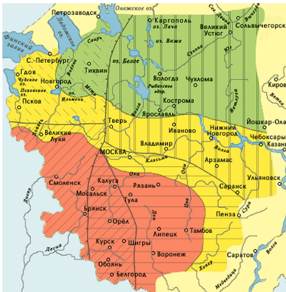
Map 1. Russian dialect zones (Bukrinskaja et al. n.d.). The green zone represents the Northern dialect belt; the yellow zone represents the transitional belt and the red zone represents the Southern dialect belt.

“carries negative meaning for nonlinguists” (1986:224). Coupland (2007:2) writes that dialects are often considered “styles of yesterday, largely out of step with the social circumstances of contemporary life.”