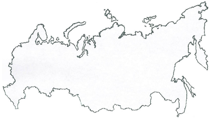
Map 2. The blank map of Russia which was presented to informants in the draw-a-map task.