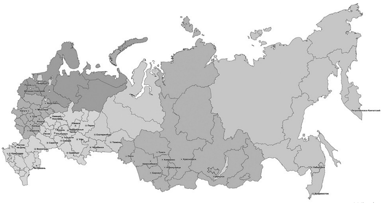
Map 3. The political map of Russia which was presented as an aid in the draw-a-map task.

regional language variation in their own terms and do not depend on their knowledge of professional linguistic vocabulary.