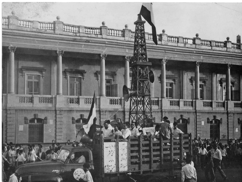
Figure I.2 Demonstration in support of oil nationalisation, Tehran, 1951

With the departure of all European and a majority of Indian employees of the AIOC in October 1951, the culmination of oil nationalisation marked the end of forty-five years of British dominance within the Iranian oil industry. This transition underscored the significant role played by both political leaders and grassroots movements, particularly oil workers, in shaping the course of this historic development. However, the initial euphoria surrounding this nationalisation was short-lived, as the 1950s witnessed one of the most challenging periods of economic decline and political repression in the country's history. The coup d'état of 1953 and the subsequent denationalisation of the oil industry's management in 1954 emerged as major factors contributing to this era of repression and stagnation.