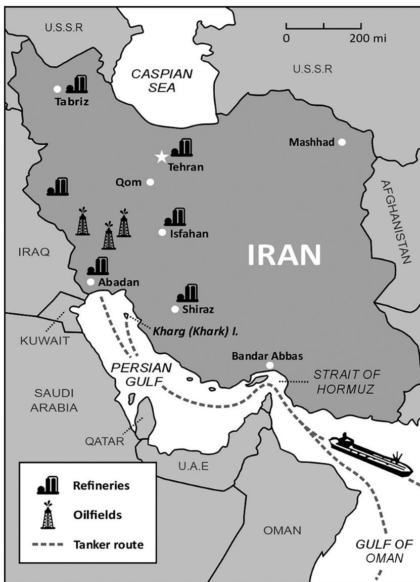
Map I.1 Iran in the Twentieth Century

of pipelines to facilitate the transportation of oil from the fields of Masjed-Soleyman to Abadan.