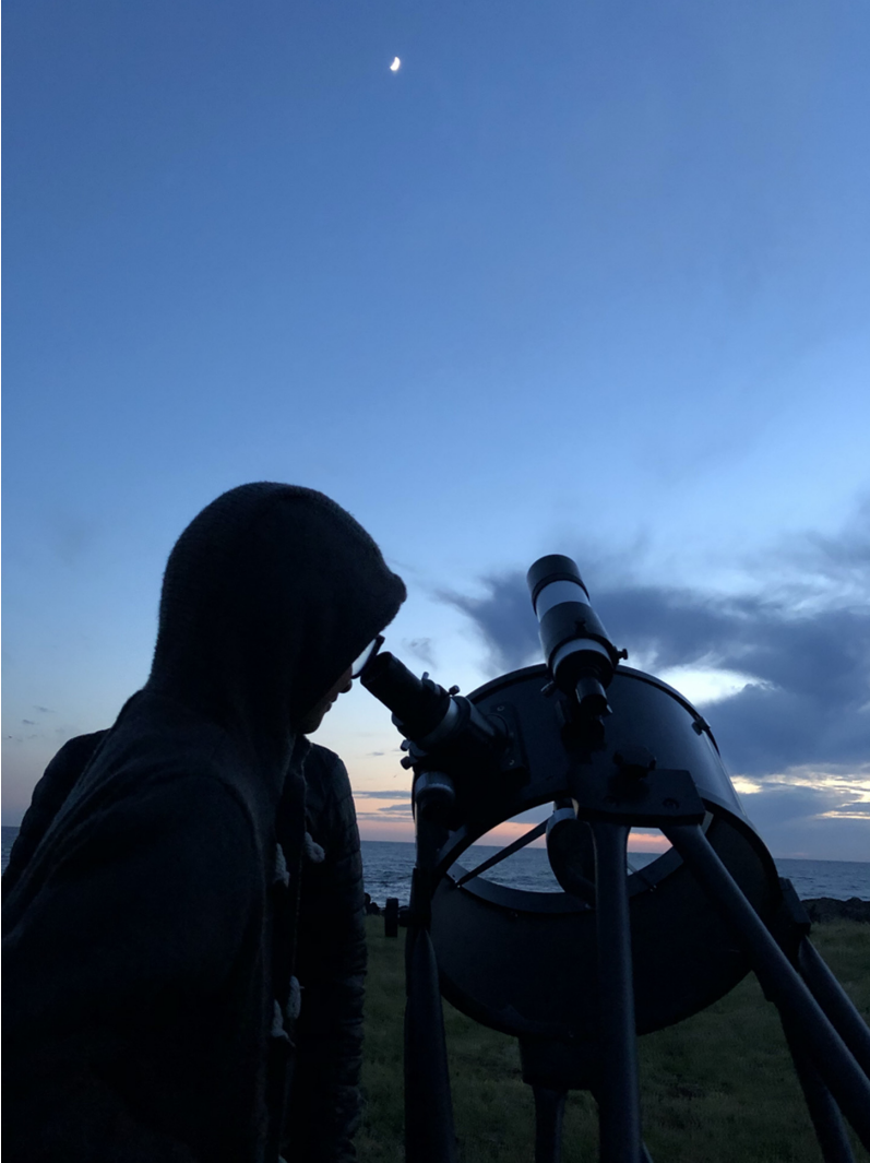
Local boy looking through telescope at the public stargazing event.