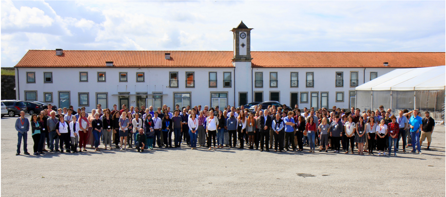
Participants of the symposium.