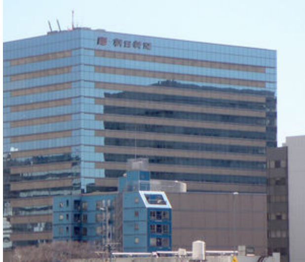
Asahi Shinbun headquarters in Tokyo

and their rival media organizations were observing the struggle with considerable glee.