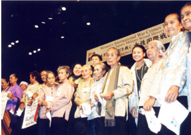
Former "comfort women" at the Tribunal

Held in public, the Tribunal attracted audiences of some 1000 people each day, and involved the participation of 62 survivors from eight countries and as well as two former Japanese soldiers. It was widely reported by such international media as the Washington Post , Wall Street Journal , Frankfurter Allgemeine Zeitung , Korea Times and the Australian Broadcasting Corporation. By contrast, only one Japanese national newspaper - the Asahi - covered the Tribunal in any detail, and Japan's television channels largely ignored the event.