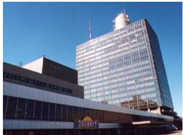
Tokyo headquarters of NHK

magazines hit the newsstands. Though the monthlies offer longer and more analytical articles, they commonly pick up themes first aired in the weeklies, and some, like the market leader Bungei Shunju (commonly abbreviated to Bunshun ) echo the heated rhetoric of their weekly counterparts.