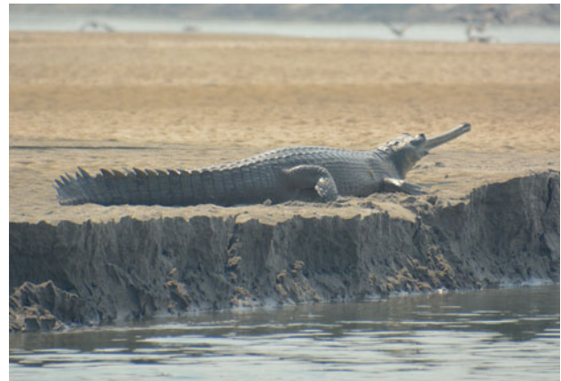
PLATE 1 A basking female gharial Gavialis gangeticus on the Ghaghara River bank, with a bulging abdomen suggesting she could be pregnant.

The Ghaghara River contains long stretches of undisturbed, free-flowing water (Basu & Singh, 2009). Although the river discharge volumes are regulated by the two upstream barrages, the surveyed stretches are free-flowing, with abundant sand available on both riverbanks. The Ghaghara River is a sink for aquatic animals dispersing from the upstream Girwa–Kaudiyala Rivers and contains significant populations of gharials, the Endangered Ganges river dolphin Platanista gangetica , turtles ( Lissemys punctata , Nilssonina gangetica and Pangshura tentoria ) and avifauna (Basu & Singh, 2009; Behera et al., 2014; Singh et al., 2021). Gharial nesting habitat in the upstream Girwa River is degraded because of vegetational succession after a channel