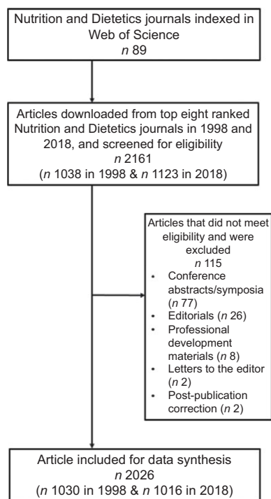
Fig. 1 Flow diagram of study selection process for inclusion

Supplemental Table S4) (25) . If studies were classified as implementation and dissemination research (T3 or T4), the researchers examined whether the manuscript included information regarding dissemination (11,26) , implementation (26) , adaptability (27) , sustainability (28) and scaling-up (29) (see online supplementary material, Supplemental Table S5).