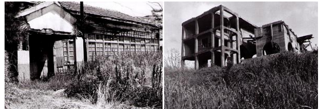
The abandoned Aso Yoshikuma work office (left) and ruined Yoshikuma mine buildings in the late 1970s.