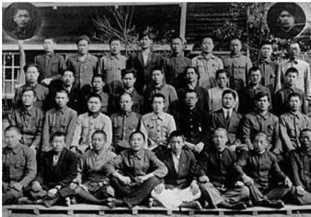
Young Korean labor conscripts at Aso Mining's Atago mine: workers assigned to the Jowa dormitory in 1942 (top) and the Yamato dormitory in 1943.

There were also 300 Allied POWs at the Aso Yoshikuma mine in Fukuoka Prefecture. Documentation includes the Aso Company Report of January 1946 and other records produced by the postwar Japanese government, as described by Japan Focus in May 2007.