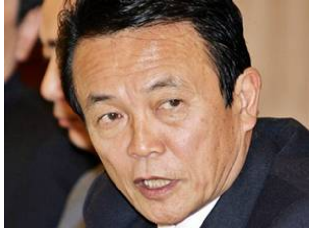
Aso Taro: Japan's future leader?

Japan the Tremendous , a bestseller written in a populist tone, highlights the peaceful nature of postwar Japan and calls the country a "fount of moral lessons" for Asia. Arc of Freedom and Prosperity: Japan's Expanding Diplomatic Horizons expatiates on Aso's tenure as foreign minister from October 2005 to August 2007.