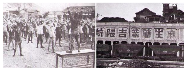
Left: Aso miners doing calisthenics during the war; right: ore cars at the Aso Yoshikuma mine. (The 100-Year History of Aso)

"In response to the enemy's materiel offensive, we will fight by means of increased coal production," said Kishi Nobusuke, then Japan's minister of commerce and industry. "All miners must come together in spirit and the patriotic mining industry must dash forward."