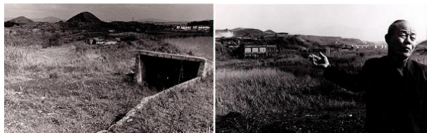
Aso Mining's former Akasaka mine in the late 1970s and a Korean forced to work there during World War II.

"The corporations' survey of remains has been insincere," the South Korean official said. "It is also strange that the family company of the foreign minister, who should be setting an example, has provided no information whatsoever." [2]