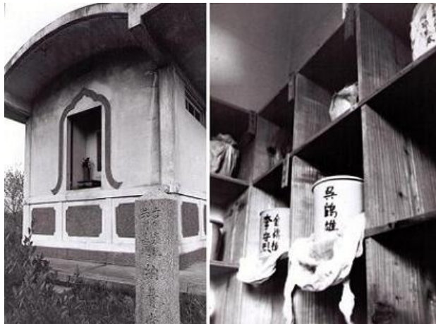
1975 images of the exterior and interior of the Aso Yoshikuma charnel house. Six containers of Korean ashes (right) disappeared the following year.

By 1976, however, all six sets of Korean remains had been removed from the charnel house shelves. Hayashi was shown a small hole beneath the shelves and told by the Buddhist priest in charge that the Korean remains had been deposited in an underground storage area. The unusual funerary practice was not further explained.